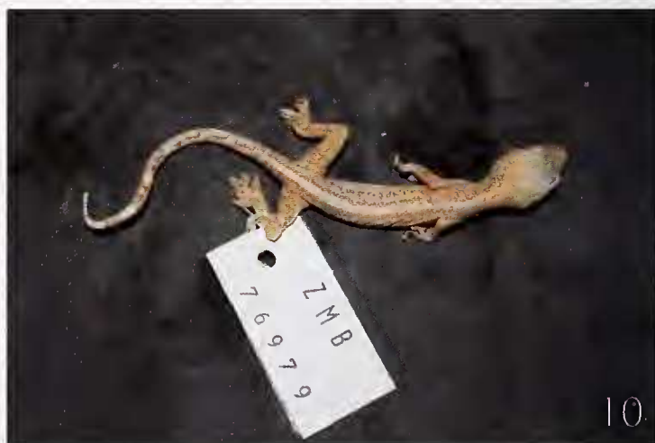
Figs 6–10. 6. Syntype of Platydictylus bivittatus , MNHN 6714, male, New Guinea; 7. Syntype of Platydictylus bivittatus , MNHN 2285, female, Pulau Waigeo, Indonesia; 8. Holotype of Gekko trachylaemus , ZMB 7511, male, Australia; 9. Holotype of Gekko remotus sp.n., ZFMK 20611, male, Republic of Palau; 10. Gekko remotus sp.n., ZMB 76979, juvenile, Republic of Palau.